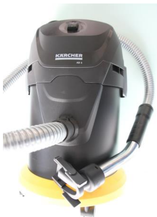
Most recommended vacuum Kärcher AD3

To remove the slot, slightly pinch the two levers, unclip one side and release it by a slight rotation. Then, remove the other side.